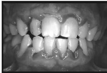
Early periodontal disease Gum recession