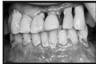
Severe periodontal disease Exposed roots

Assign a score based on current findings. Refer to a dentist for further evaluation if score is 4 or more.